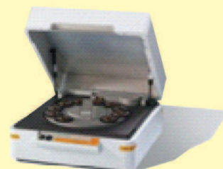
Environment Chemistry Equipment