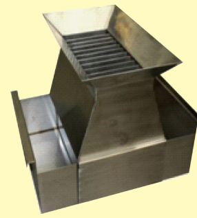
Mineralogical Equipment: Microscopes, Refractometer, Magnetic separator, etc