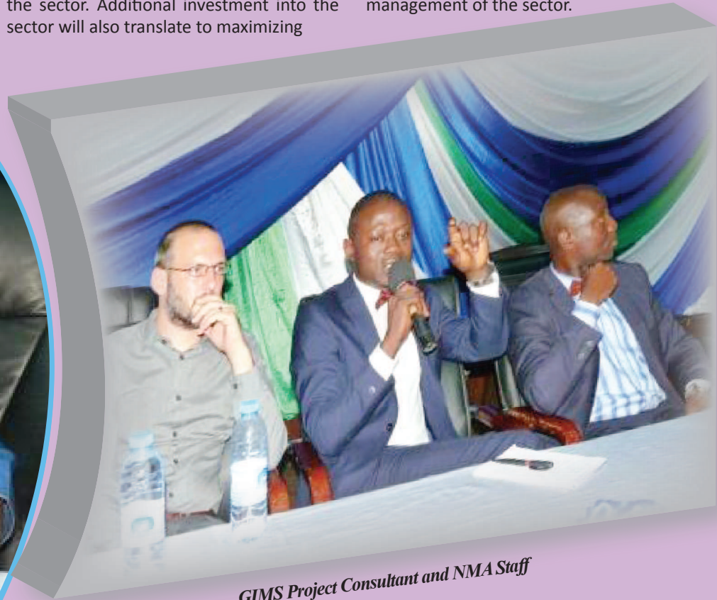
GIMS Project Consultant and NMA Staff

He pointed out that the World Bank and DFID have provided support for government capacity building in order to improve on the management and regulation of the extractive industries through Extractive Industry Technical Assistance Project (EITAP) set up within the Ministry of Mines and Mineral Resources. He added that the total project amount is $ 11.35 with a World Bank Contribution of $ 8m and DFID contribution of $ 3.35m.