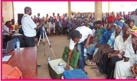
Community meeting on CDA Dasse Chiefdom

Banta Chiefdom pinpointed that, the CDA is a very good initiative by the Government of Sierra Leone as it would go a long way to