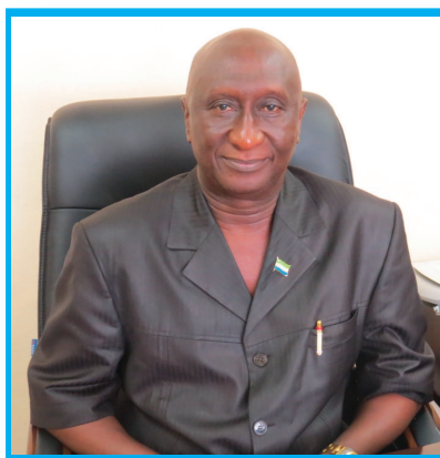
Hon. Alhaji Minkailu Mansaray