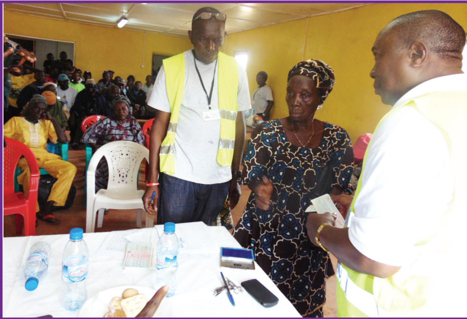
VIMETCO surface rent payment

In accordance with Section 34 of the Mines and Minerals Act 2009, the Sierra Mineral Holdings (VIMETCO) presented the sum of Le 896,000,000 (Eight Hundred and Ninety Six Million Leones) to all the landowners of the bauxite mining at Gondama Site, Moyamba District as its 2016 Annual Surface Rent payment on the 15th of February 2016. The cheques were presented to beneficiaries at a colourful ceremony in Moyamba, attended by Community people (representatives of landowning families) from the five chiefdoms (Dasse, Upper & Lower Banta, Ngao and Kpanda Kemoh) with their paramount chiefs, the Moyamba District Officer (chairman of ceremony), representatives of the Ministry of Mines and Mineral Resources/National Minerals Agency, the Local Unit Commander and the top management of the SMHL Company.